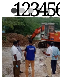
Putheri restor disrupted after parties claim 'lake bed'

Now we are on Telegram too. Follow us for updates