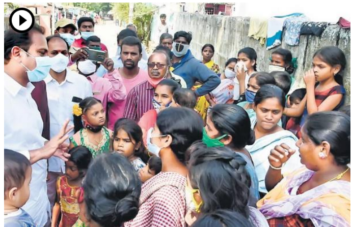
Mystery illness reported in another village near Eluru in Andhra Pradesh, 22 fall sick