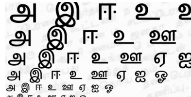
Old and almost-forgotten Tamil textbooks to get new lease of life and be sold online