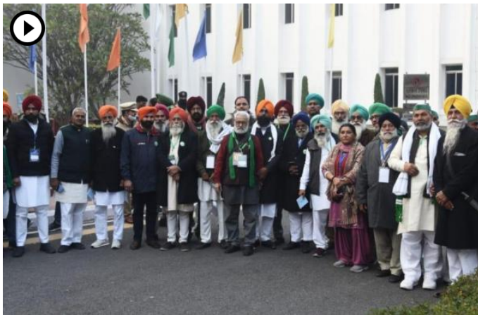
11th round of talks conducted between protesting farmer unions and Centre